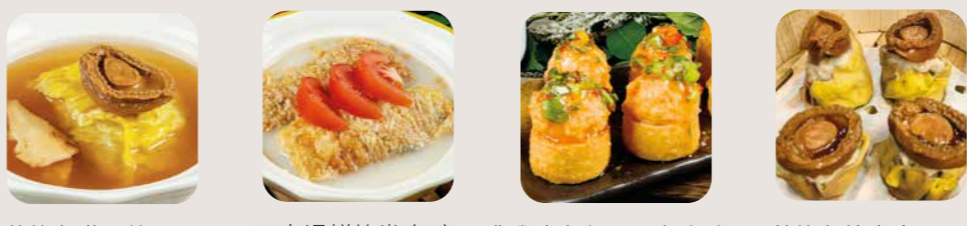
1.松茸鮑魚灌湯餃 $13.98 Abalone Dumpling in Consommé 2.上湯鮮竹卷 (SP) Beancurd Wrap with Minced Pork & Shrimp in Broth 3.濃雞汁肉心滑豆腐 (SL) Stuffed Shrimp Paste W/ Egg Tofu 4.至尊鮑魚燒賣皇 $13.98 Prince Abalone Siu Mai