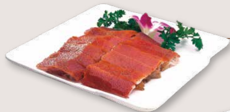
化皮乳豬 Suckling Pig