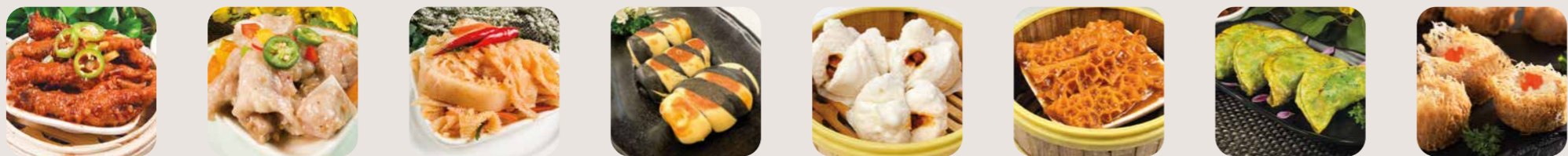
12.京醬蒸鳳爪 (SP) Steamed Chicken Feet w/ Hoisin Sauce 13.金蒜蒸排骨 (L) Steamed Spare ribs w/ Garlic Sauce 14.XO五彩牛柏葉 (SL) Sliced Beef Tripe w/ X.O. Sauce 15.鴛鴦腊腸卷 (SL) Steamed Mixed Preserved Sausage Buns 16.蜜汁叉燒包 (L) Steamed BBQ Pork Buns 17.金醬柱候牛筋肚 (SL) Beef Stomach & Tendons w/ Chu Hou Sauce 18.脆炸韭菜盒子 (L) Deep Fried Chive Dumplings 19.香酥荔芋帶子甫 (SL) Deep Fried Scallop, Minced Pork & Taro Pastries