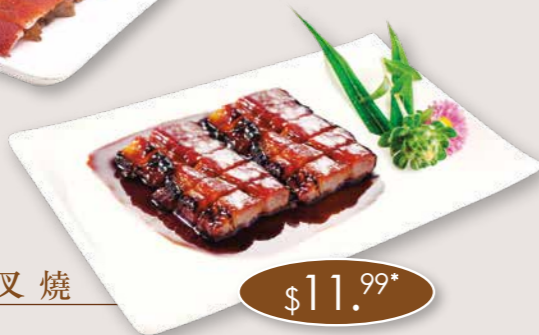
全自然蜜汁叉燒 BBQ PORK