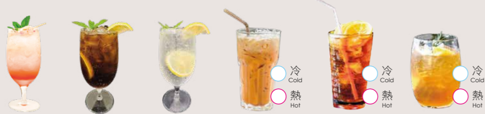
荔枝戀人 Lychee Special $ 6.99 檸檬可樂 Coke w/ Lemon $ 4.99 檸檬七喜 7 Up w/ Lemon $ 4.99 奶茶 Milk Tea $ 4.99 (H) $ 5.99 (C) 檸檬茶 Lemon Tea $ 4.99 (H) $ 5.99 (C) 香檸柚子蜜 Grape Fruit Honey $ 6.99