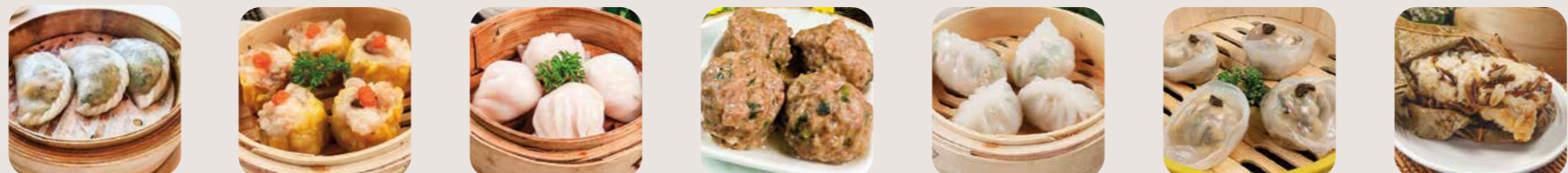
5.水晶粉角仔 (L) Steamed Minced Pork & Dried Shrimp Dumplings 6.五星燒賣皇 (SP) Steamed Siu Mai 7.水晶鮮蝦餃皇 (SP) Steamed Crystal Prawn Dumplings 8.安格斯牛肉球 (L) Steamed Angus Beef Balls 9.濃情潮州粉粿 (L) Steamed Meat, Dried Shrimp & Peanut Dumplings 10.黑松露野菌餃 (SP) Black Truffle & Wild Mushroom Dumplings 11.瑤柱野米珍珠雞 (SL) Sticky Wild Rice Wrap Stuffed w/ Dried Scallop & Minced Pork