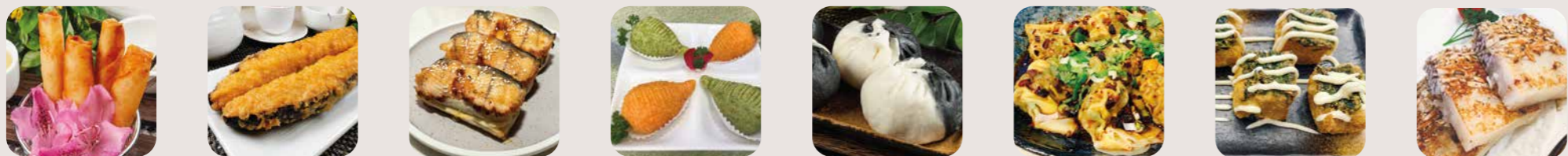
20.龍鳳大春卷 (L) Deep Fried Prawn Spring Rolls with Cheese 21.百花釀原條茄子 (SL) Pan Fried Whole Eggplants w/ Shrimp Paste 22.鰻魚叉燒酥 (SL) Baked BBQ Pork & Sea Eel Pastries 23.鴛鴦咸水角 (SP) Deep Fried Minced Pork & Dried Shrimp Dumplings 24.黑白無雙生煎包 (SP) Pan Fried Pork Buns 25.香辣陳醋餃子 (SL) Minced Pork Dumplings w/ Spicy Vintage Vinegar 26.和風翡翠滑豆腐 (L) Deep Fried Tofu with Seaweed 27.香煎芋絲蘿蔔糕 (SP) Pan Seared Turnip Cake w/ Shredded Taro Root